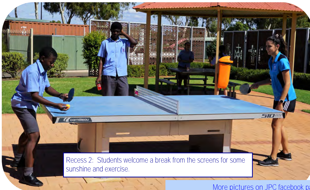
Recess 2: Students welcome a break from the screens for some sunshine and exercise.